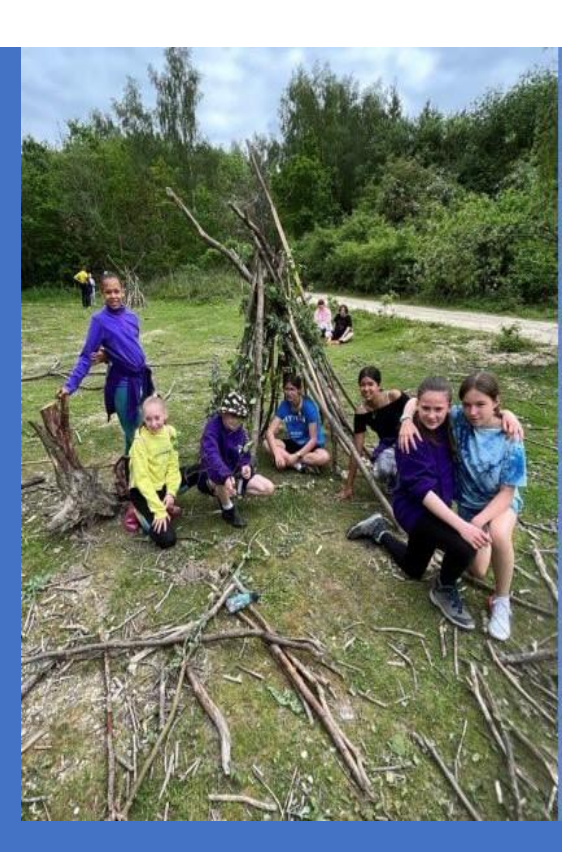
"With God, All Things are Possible."